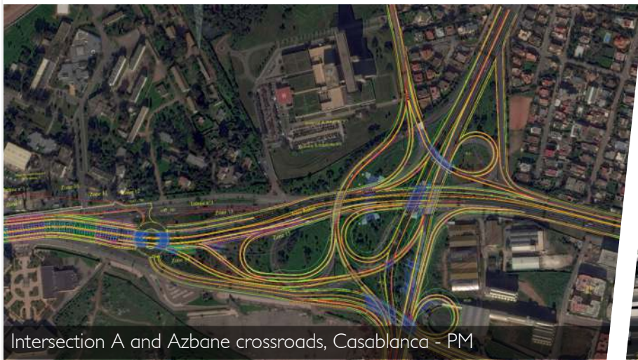
Intersection A and Azbane crossroads, Casablanca - PM