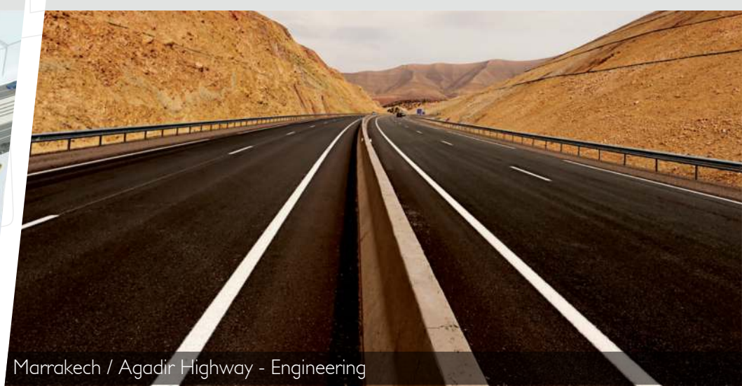
Marrakech / Agadir Highway - Engineering