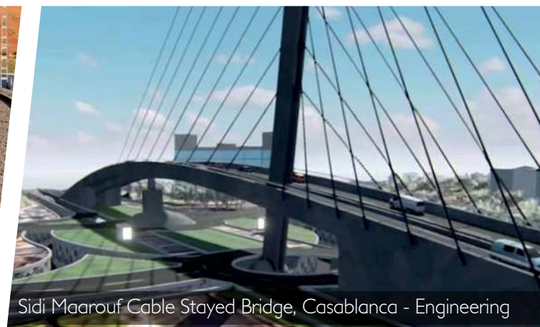
Sidi Maarouf Cable Stayed Bridge, Casablanca - Engineering