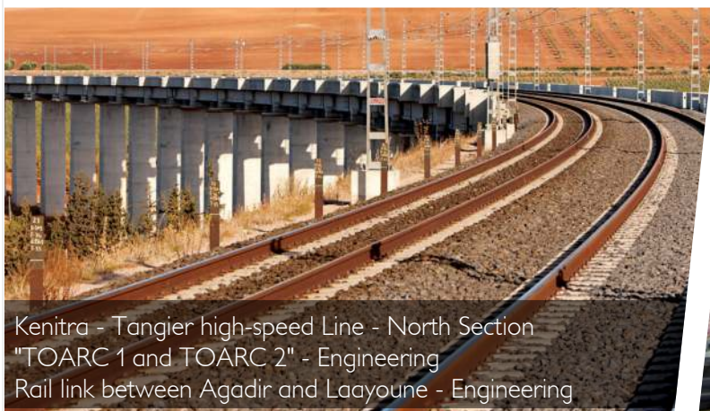
Kenitra - Tangier high-speed Line - North Section "TOARC 1 and TOARC 2" - Engineering Rail link between Agadir and Laayoune - Engineering