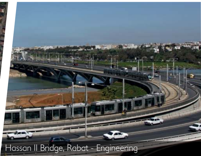
Hassan II Bridge, Rabat - Engineering